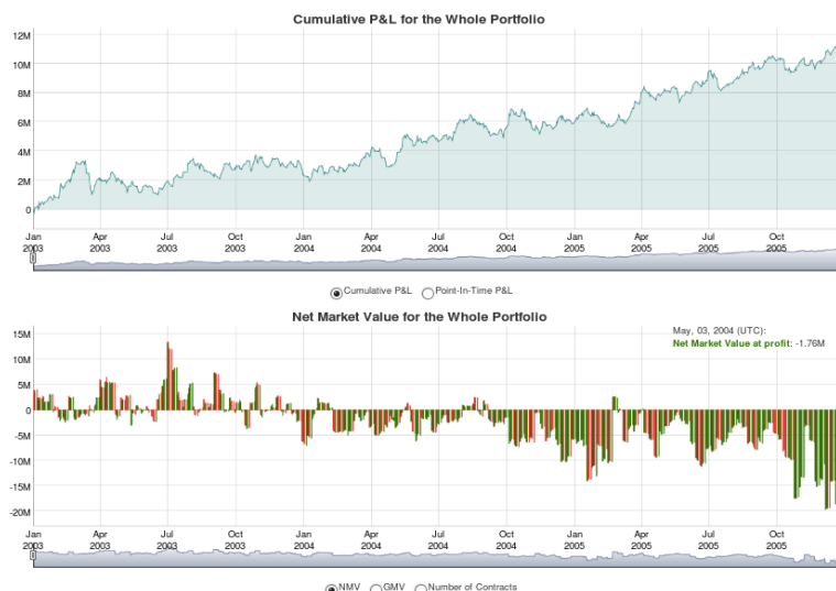
Figure 5: Plots with commodity data. The plot of P&L is at the top and the plot of market values is at the bottom. Green bars represent profit and red bars represent loss. The user can zoom in on the plots by either selecting the corresponding region with mouse or changing the time slider bar.

The plots are interactive using the dygraphs package [?]. The user can zoom in to look at any specific time period on the plots. She can either select and drag the corresponding region with mouse, or change the time slider bar beneath the plots. The user can go back to the initial scale by double clicking the plot. Color of the plots is based on the sign of point-in-time P&L. Green bars represent profit and red bars represent loss. If the cursor is hovering above a specific bar, the legends of the plot will give specific values of the date and the response variable of that bar. Note that the data is automatically rounded. For example, a P&L of “2,856,000” will be presented as “2.86M”.